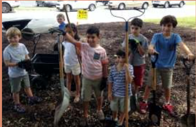
At Alif Institute, volunteering spirit starts at the very young age! Alif students joining forces to spread mulch during "Beautification day"!