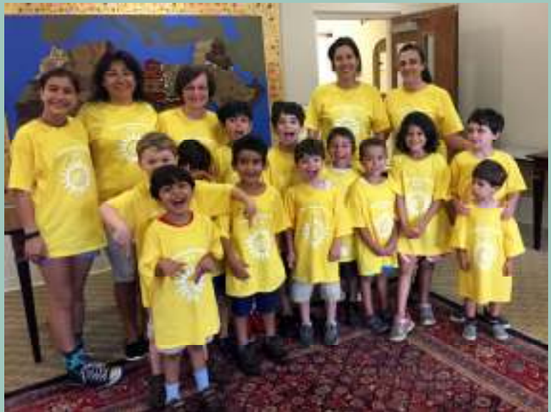
Campers and counselors really got into the spirit of summer camp!

In June, 2015, Alif offered its first summer camp. Parents and children were both pleased with the camp, which offered fun, summer activities while immersing campers in Arabic language and culture.