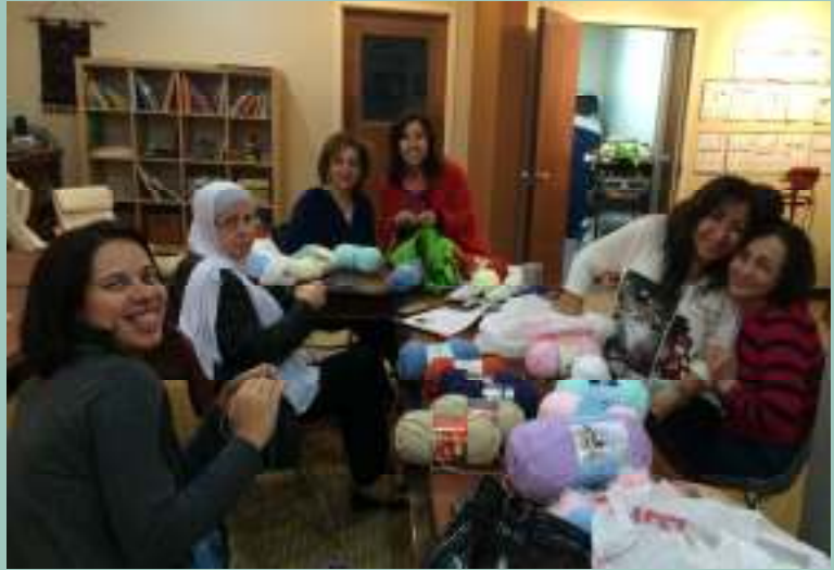
Ladies of the Knit & Stitch club. Even though they don't all speak the same language, their love of community and the arts forms strong bonds across cultures.

These enjoyable weekly classes are one of the best ways to connect with living Arab culture.