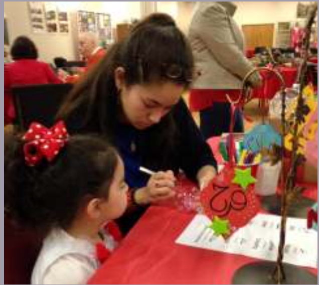
Volunteer and young girl designing ornaments with Arabic inspiration words during the event 'A Taste of Christmas in the Arab World'.

These events allow us to build community, attract new people, and explore more deeply different aspects of Arab culture.