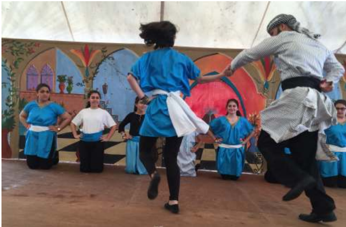
Getting into the swing of things with a dabkeh performance at the 2015 Atlanta Arab Festival.

In 2015, despite extremely rainy weather, the festival drew over 3,500 attendees. A big improvement this year was utilizing adjacent parking lots and hiring shuttles and attendants to help attendees reach the festival grounds more easily.